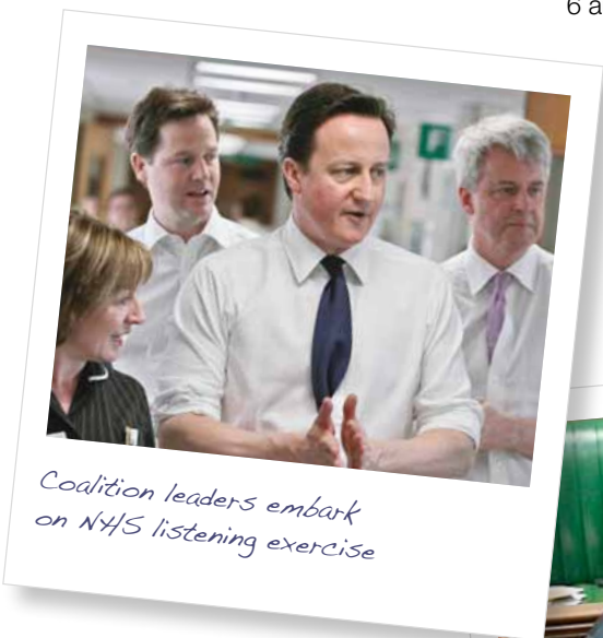
Coalition leaders embark on NHS listening exercise

The Government subsequently set up a series of events as part of their listening exercise, which included centrally organised and local forums. In June, the NHS Future Forum (a group of 45) reported back to the Government on its findings and Andrew Lansley announced that changes would be made to the Bill based on the recommendations from this forum. In June, the House agreed to recommit certain clauses and schedules to the Public Bill Committee. The Committee took written and oral evidence and considered the bill clause by clause throughout July. It is expected that the Bill will have its report and third reading stage on the 6 and 7 September.