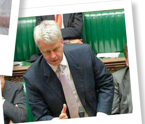
Andrew Lansley MP, Secretary of State for Health