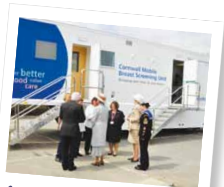
Outside the Cornwall Mobile Breast Screening Unit